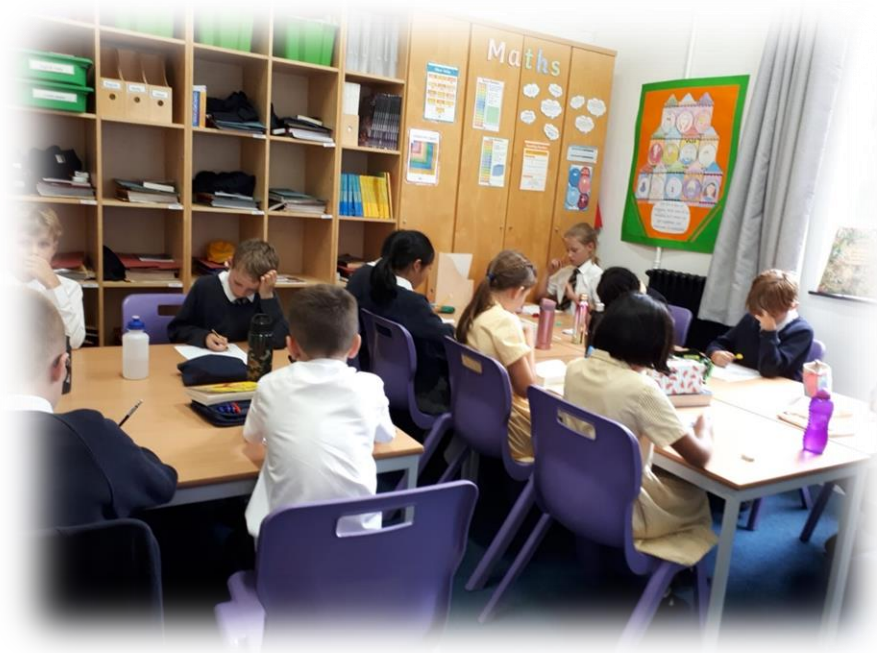
Year 5 working hard!

In the interim, while the masterplan is being finalised and we wait to start the detailed design process, we will be putting in place two high-quality temporary classrooms which will provide all the space we need to see us through. We had hoped that these new classrooms would be in place before the start of term, but our initial planning application was unsuccessful. We're really sorry that this has happened, but are confident it will not impact on the children's learning and that our temporary solution is working well. We are in the process of re-submitting our planning application for the temporary classrooms and hope to have this resolved before the start of the Spring term.