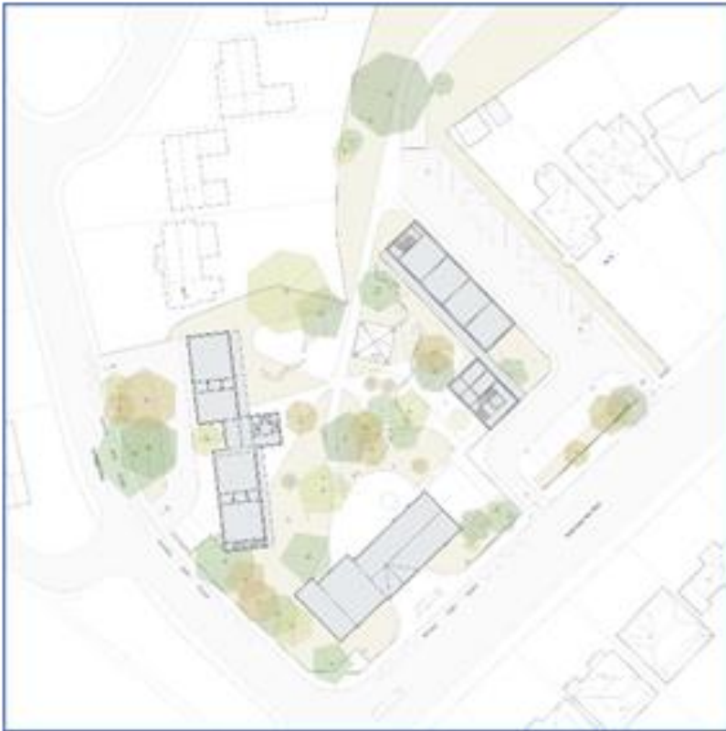
Possible plan view of St David's