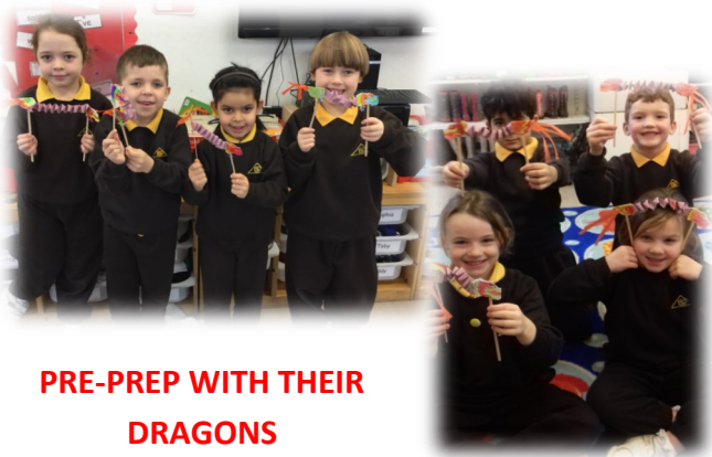
PRE-PREP WITH THEIR DRAGONS